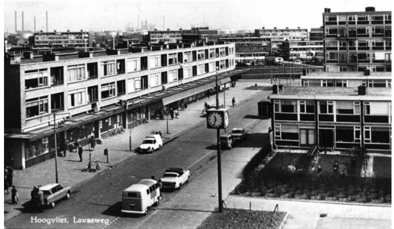
| New Town Hoogvliet

Different ways of looking at New Towns from a heritage perspective have resulted in different ways of urban (re)development in practice, which stood at the centre of the New Town Heritage: Exploring the Boundaries seminar. The excursion of the first day led the participants through two first-generation New Town areas in Rotterdam, Hoogvliet and Pendrecht, which had been redeveloped during the past decade. Tour guide Michelle Provoost showed how the redevelopments in Hoogvliet, originally designed in the late '40s by CIAM architect Lotte Stam-Beese, had a particular joint redevelopment approach in which the focus lay on discovering the area's characteristics and defining its 'DNA'. Many stakeholders were involved in this process, coming from the municipal planning department, local politics, development agencies and housing corporations. These stakeholders evaluated the existing qualities of the original masterplan in search of guiding principles to use for Hoogvliet's redevelopment, instead of applying an all-encompassing master-plan themselves. The guiding principles were formulated in the so called Logica-project.