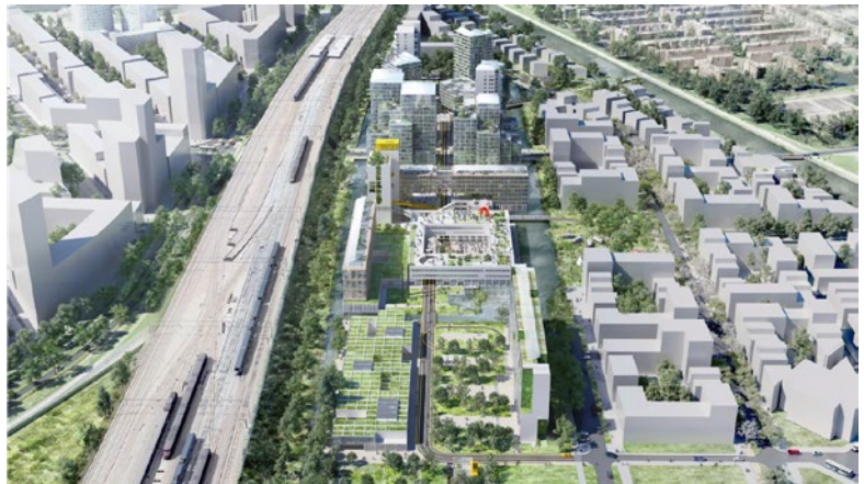
4 Render of the new Bijlmerbajes plan - finding a balance between re-use and new design