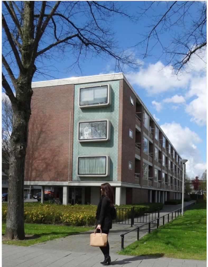
2 Fishbowl Flats, Pendrecht

The second tour of the day started at housing corporation Woonstad Rotterdam in Pendrecht. Pendrecht too was a neighbourhood in Rotterdam which for a long time was known for its low employment rate and poverty. Tour guides Endry van Velzen from De Nijl Architects and Edwin Dortland from Woonstad Rotterdam showed us how Pendrecht had been subjected to 20 years of renovation by means of different projects with their own unique redevelopment approaches focusing on both the housing and public space or the area. The neighbourhood became less car-centric and roads were redesigned into green strips with room for water, cyclists and pedestrians. The large scale redevelopments thus focused on a continuation of the existing qualities of the original master plan of Pendrecht, designed by Lotte Stam-Beese and Van den Broek & Bakema Architects. Also, Pendrecht was one of the first neighbourhoods in which a restorative approach was taken towards 50's housing blocks, notably the Fishbowl flats. Thus, the renovation of Pendrecht shows a deep understanding of the original urban design principles of Pendrecht and a capability of reinterpreting them in the context of contemporary (social) housing needs.