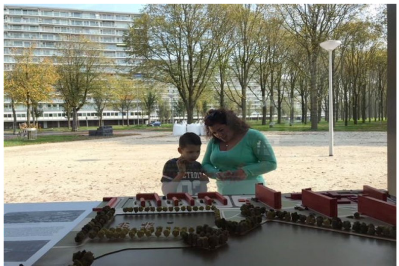
5 Visiting the Van Eesteren Museum